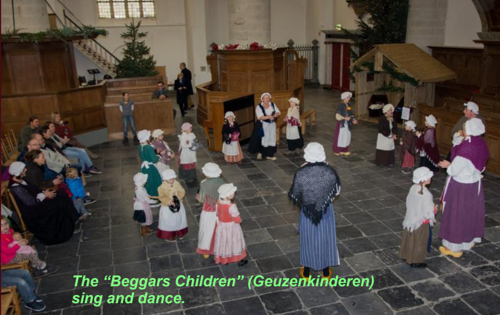
The "Beggars Children" (Geuzenkinderen) sing and dance.